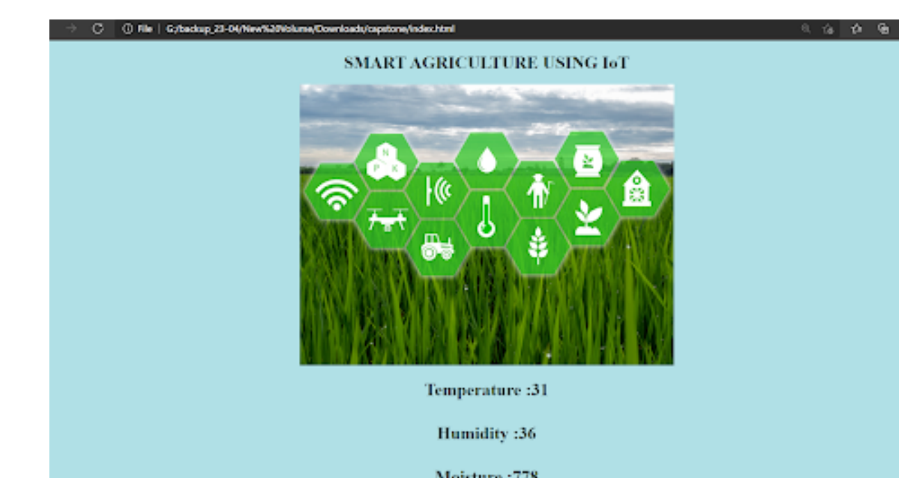
Fig. 1: Web application with sensor values